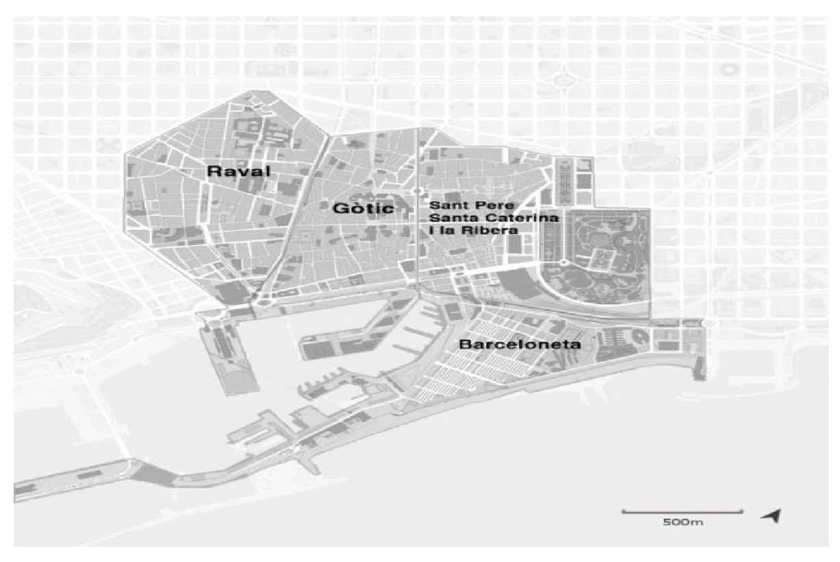
2. Picture Ciutat Vella

These four neighbourhoods are la Barceloneta, Sant Pere Santa Caterina y la Ribera (which is too long so locals refer to it as "el Born"), el Gothic and el Raval (Picture 2.). At this point it is important to note that first I used the term "Raval district", which is not correct as one of the first informants made clear for me. The Raval is a neighbourhood, such as the other three, in the district of Ciutat Vella, however in some of the studies of the neighbourhood the incorrect term is used. In the last decades Ciutat Vella, like many other old neighbourhoods in European countries, went through urban renewal programs. These programs in the case of Barcelona are called PERI, (Special Plan for Interior Reform) which try to target regeneration, attract new investments and reducing sociospatial inequalities (Arbaci & Tapada-Berteli, 2012:287-289; Pareja & Tapada, 2001:4). Later on it will be referred to how these processes could be considered gentrification or goes along with the phenomenon of gentrification, which is considered as a harmful process for the neighbourhood by local activists.